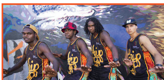
INDIGENOUS HIP HOP