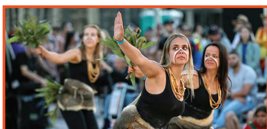
DJIRRI DJIRRI DANCERS